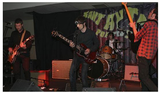
Local band "Los Altragos"

Continuing with musie, it also takes place during Sant Antoni's festivities "Sant Antoni Pop Festival", which started more than fifteen years ago and it has already become a tradition. First thought as a garage music festival of local bands, through the years it has consolidated and has become a reference for this kind of music now hiring both national and international bands.